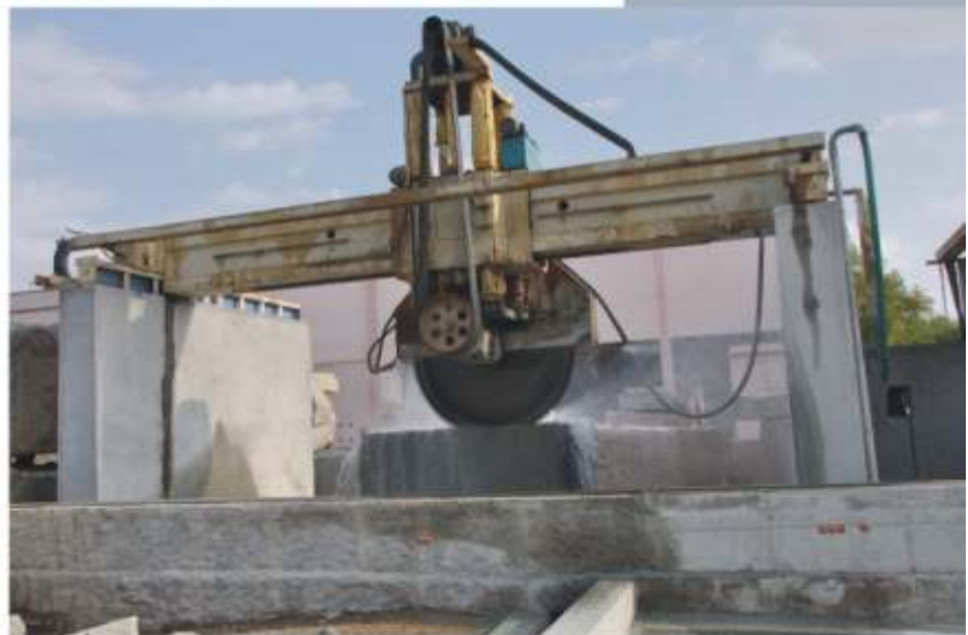
DEVELOPMENT OF STONES, JAIPUR, INDIA